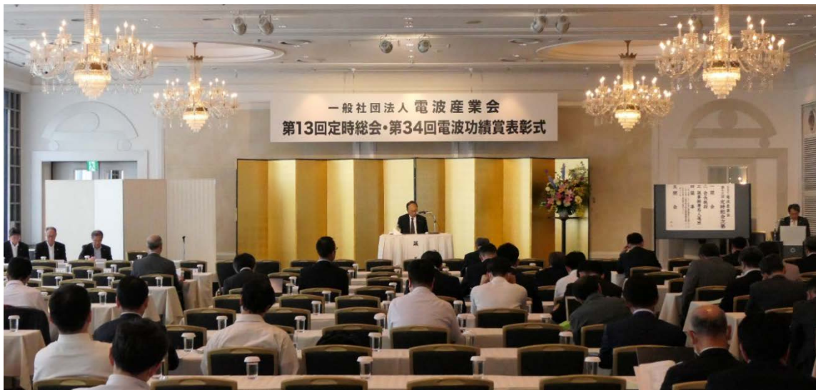
The 13th Annual General Meeting