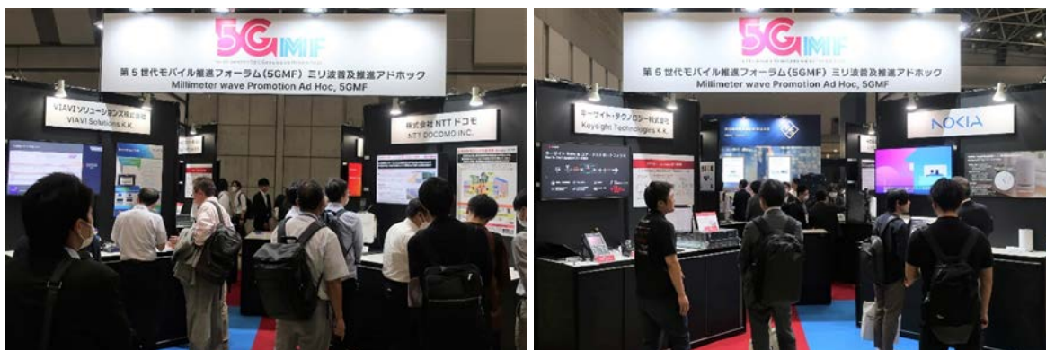
The exhibition booth