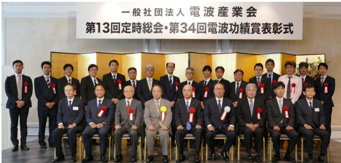
Commemorative photo with the Award winners